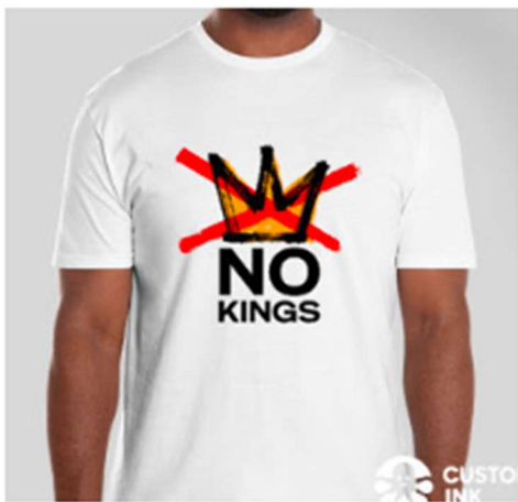
No Kings tee-shirt. Round collar style only. Various sizes. $15 donation is appreciated. Hurry while they last!

Finance folks: The wonderful volunteer who typically reviews our books this time of year is not available this year. Our books are simple, but a review of them is required in order to be in compliance with the Florida Democratic Party. Expertise with Quicken and financial statements is a requirement, but you do not have to be a CPA. (This is not a “corporate audit” process.) This review needs to be completed by April 1. We have a terrific Treasurer so our books are in good order.