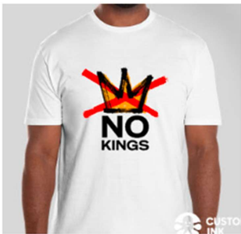
No Kings tee-shirt. Round collar, men-sizing only. Various sizes. $15 donation is appreciated. Hurry while they last!