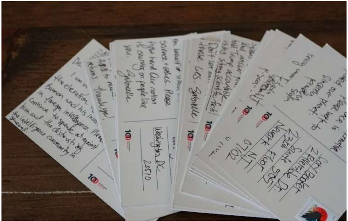
Postcard writing to elected officials