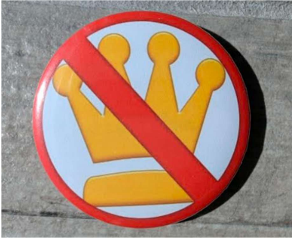
No Kings button. Donations are appreciated!