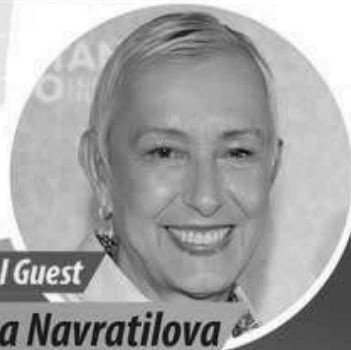
Special Guest Martina Navratilova